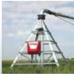
Robust pivot points Hot-dipped galvanized steel legs and heavy-duty cross-members form a rugged foundation